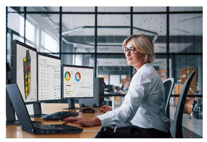
provide you with key functionality, so you can keep your server secure.

Server security is also about confidentiality, availability, and integrity. That means, a server has to be nearly invisible, should work 365 x 24 hours a year in a well-defined state and keep its integrity. For data residing or processing on the server this means: Access to the data only to authorized people, whenever they need access, they can access and nobody unauthorized could modify or delete the data. PRIMERGY servers