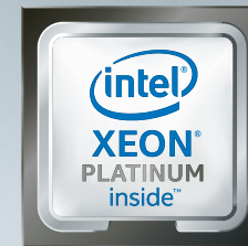
Intel® Xeon® Platinum processor