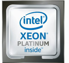
Intel® Xeon® Platinum processor